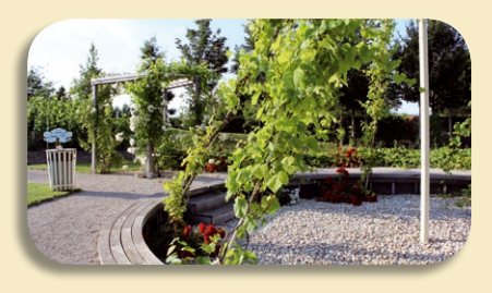
the evolution of pruning techniques