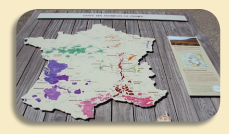
a map of the french vineyards