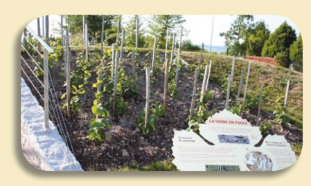
vines "en foule" (in masses)