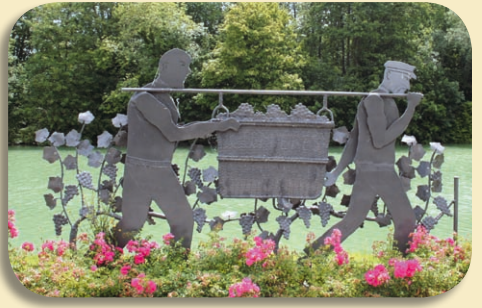
harvesting in the vineyard

Each group of sculptures is explained by an interpretive panel, with all the essential details of the champagne making process.